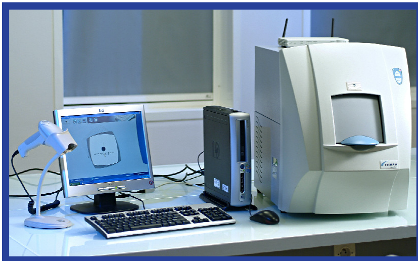
Reading & interpretation