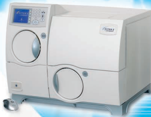
VITEK® 2 Compact