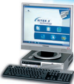
PC + Software